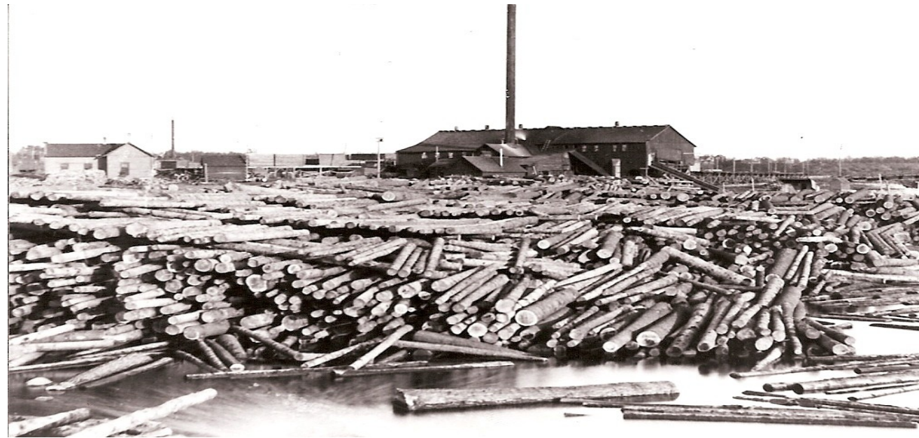
Pictured above- a logging section sometime in the 1920's with logs in storage piles.

We try to find interesting pictures and information on Benton County History to put in the newsletter!